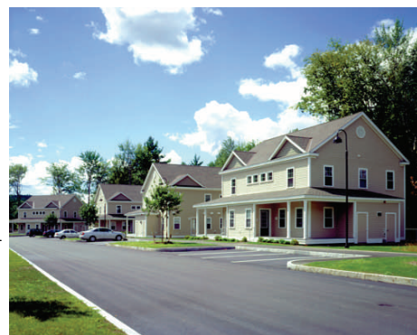
Sachem Village, Lebanon, NH

Only through a photographic medium can enough detail about the physical manifestation of planning language be understood. Comprehensive understanding can best be achieved through photographs and images for analyzing if specific innovative solutions are appropriate for an individual's own locality. Key components to its success will be broad openness to the community and its dynamic nature.