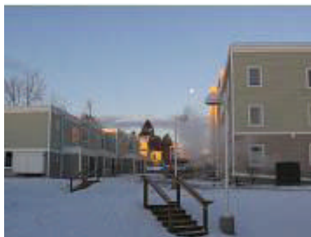
Burlington Cohousing, Burlington, VT

The end product will be a photographic library, tagged and searchable which is distributable through the internet/web. Keep reading the Yankee